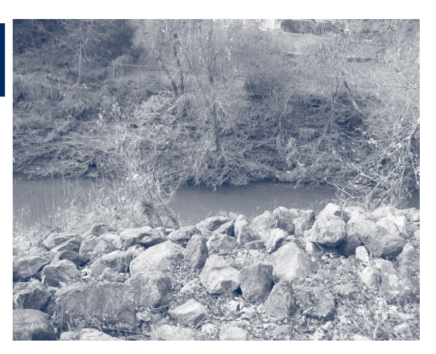
This is an example of a creek with incised banks.

Flood control is a separate requirement not addressed in this document. Applicants will need to refer to the Alameda County Hydrology & Hydraulics Criteria Summary (HHCS) for additional stormwater management requirements relating to flood control.